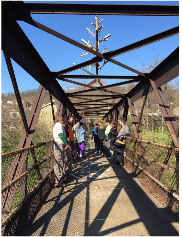
Bridge of Sighs.